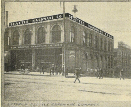
EXTERIOR SEATTLE HARDWARE COMPANY.