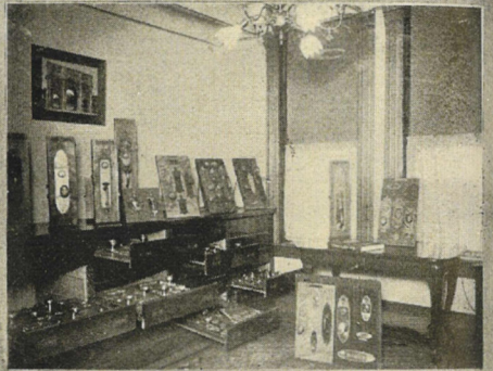
BUILDERS SUPPLY DISPLAY ROOMS, SEATTLE HARDWARE CO.