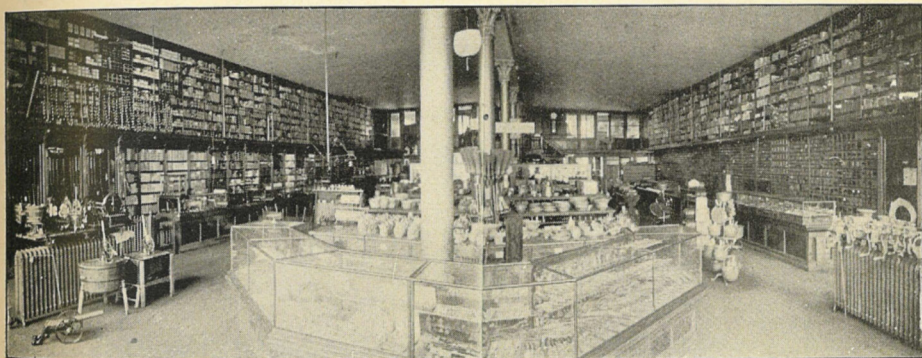
INTERIOR MAIN STORE OF SEATTLE HARDWARE CO.

Among the big houses which have given Seattle a reputation throughout