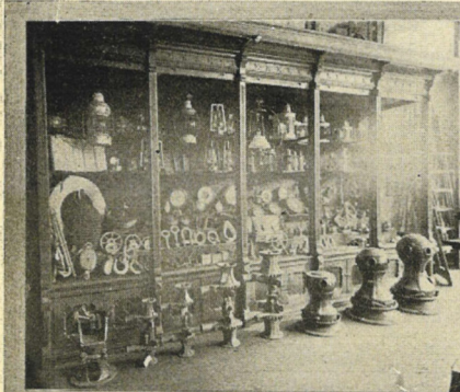
SHIP CHANDLER'S DEPT., SEATTLE HARDWARE CO.

The Pacific Coast Company, which now has its general offices and head-